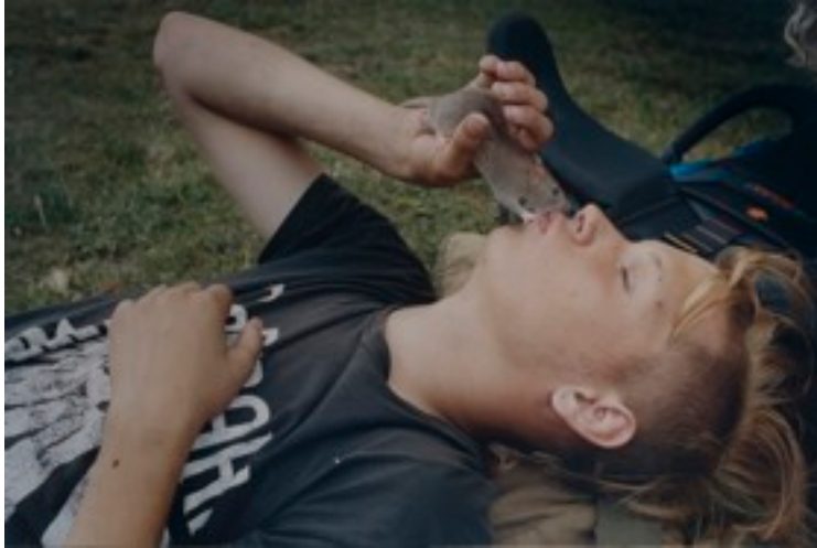
'Xavier' by Niall O'Brien, 2009. C-type print

Selected low-res images of work from 'Good Rats' (high-res images available on request):