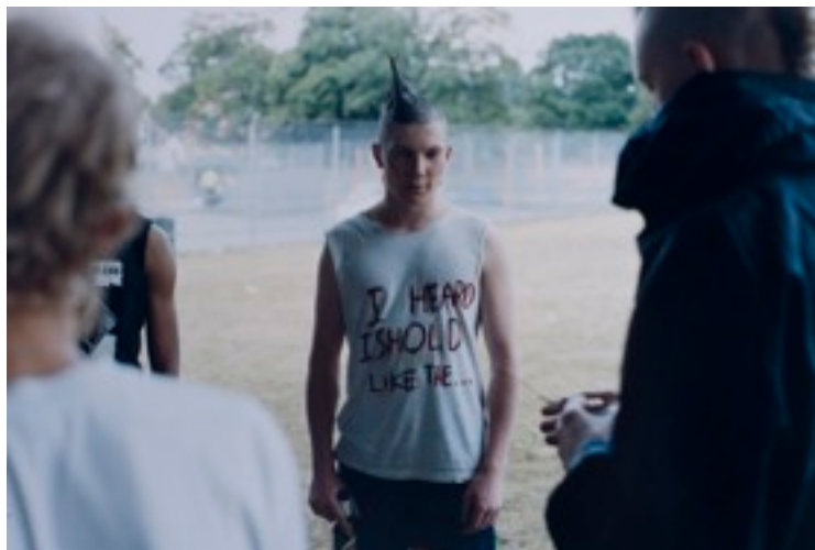
'Luke – KBC' by Niall O'Brien, 2009. C-type print